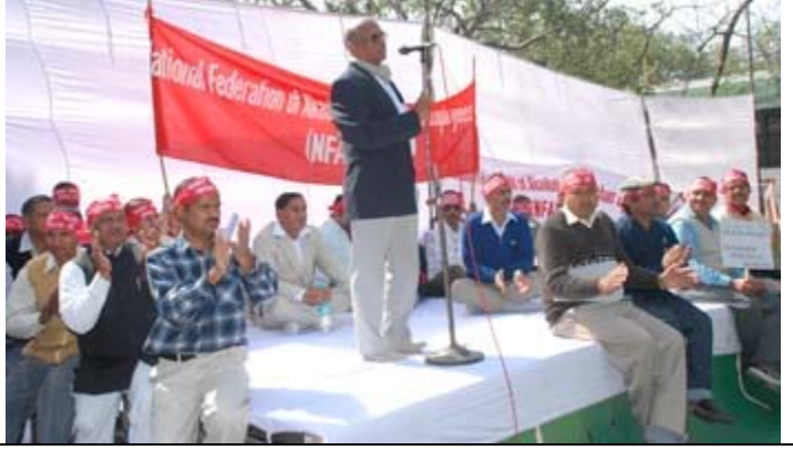
Com.K.K.N.Kutty G.S. Conf. of Central Govt Employees & Workers declaring support of all central Govt. Employees