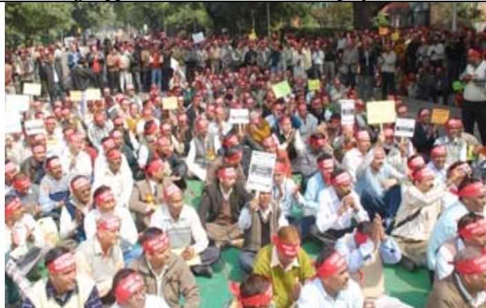
More than 3500 employees of AIR and Doordarshan hearing the Leaders at Parliament Street.