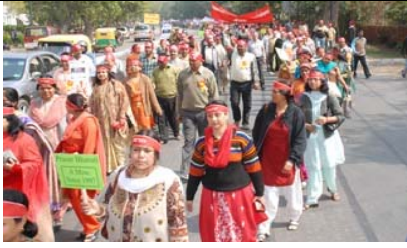
Active Women participation on Barakhamba Road