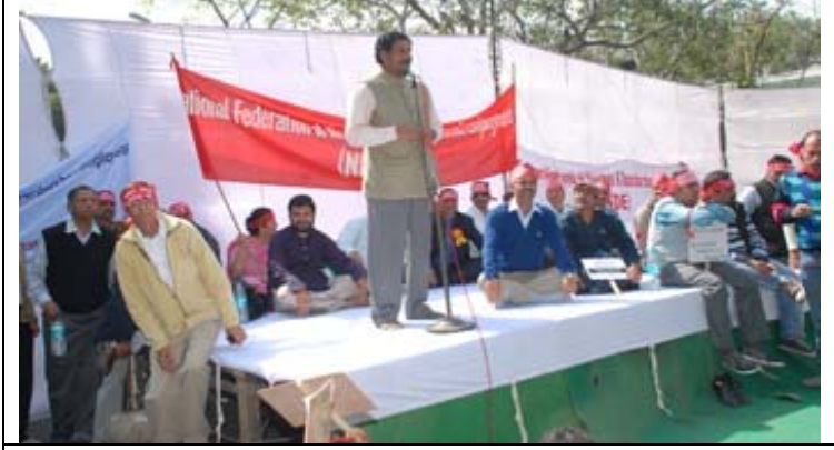
Advocate Sampath Hon'ble MP addressing the Gathering