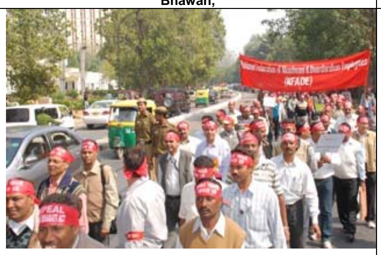
March on move - crossing Haily Road