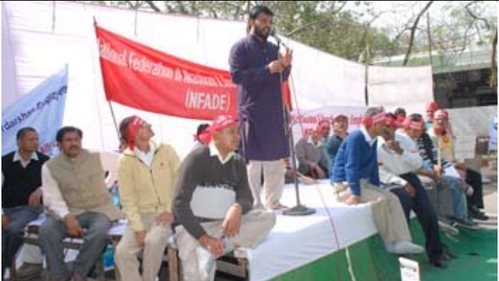
Sh.M.B.Rajesh Hon'ble MP addressing the March